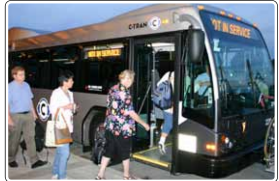
Passengers board C-TRAN's new hybrid bus 99th Street Transit Center