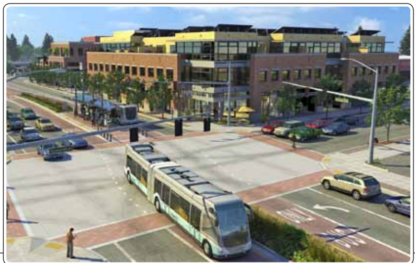
Fourth Plain bus rapid transit simulation Fourth Plain and Grand Boulevard